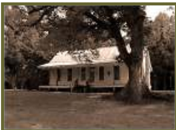
Historic Peter Cauble House was built in the late 1830s at Peach Tree Village, Tyler County, Texas.